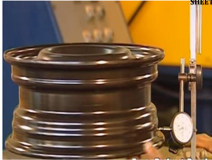
Run Out testing