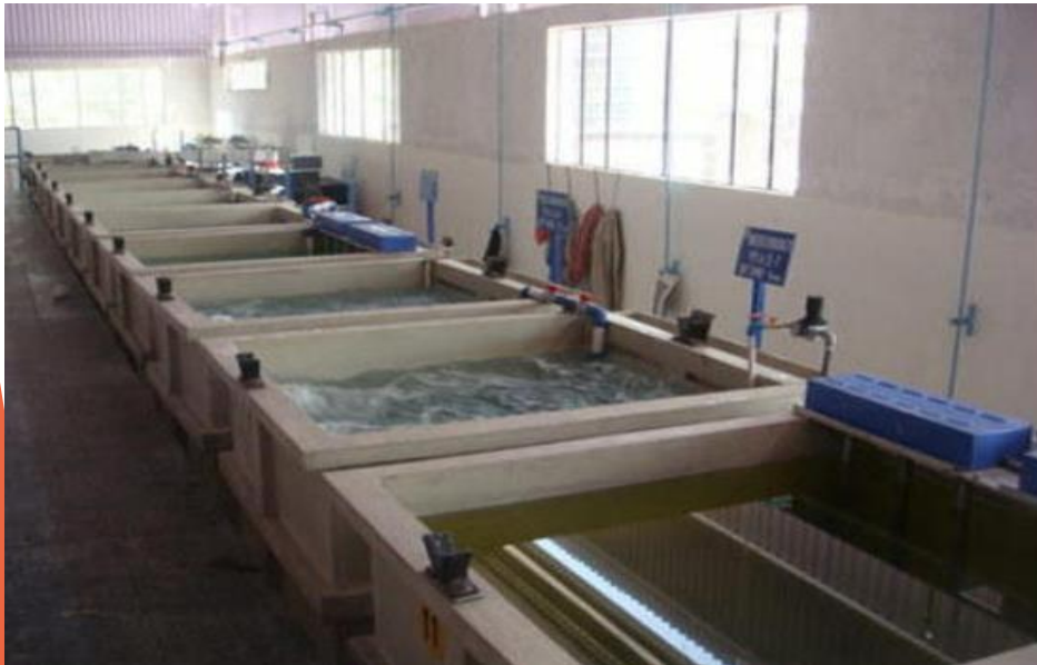
Phosphating dip plant