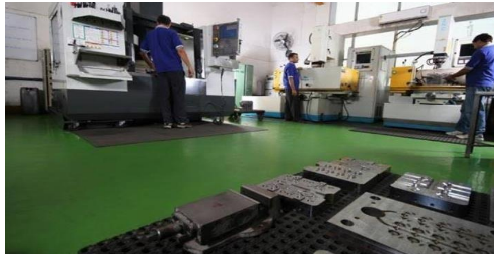
Tool room - CNC Lathe , CNC Milling