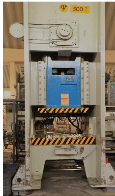
PNEUMATIC CLUTCH POWER PRESS