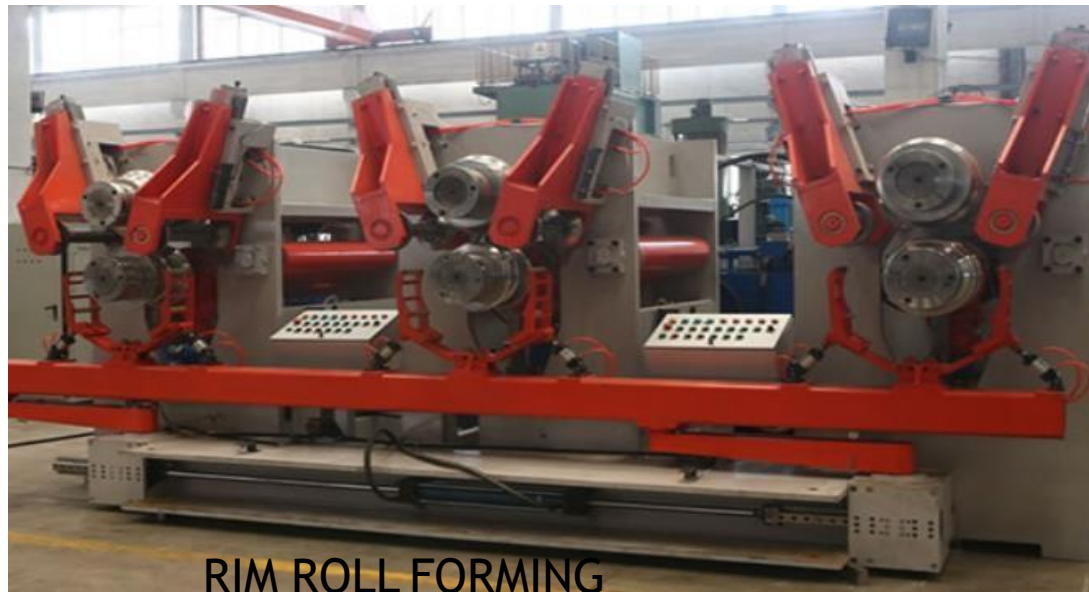
RIM ROLL FORMING