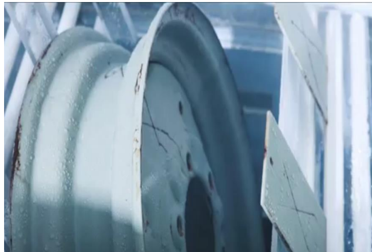
Salt spray testing