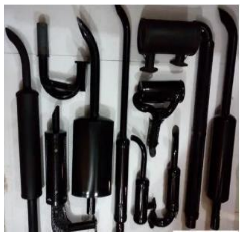
Mufflers & Silencers